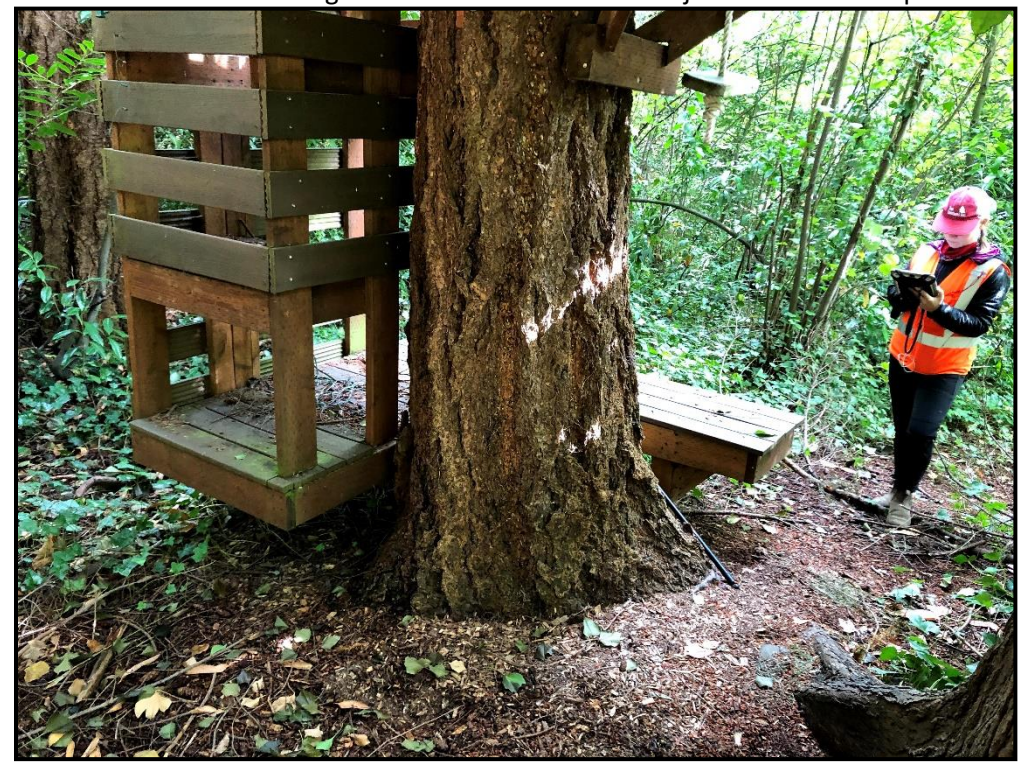
Photo 4. Tree 1810 has a platform and ladder with swing and zipline attachments; it is a primary support for the structures.