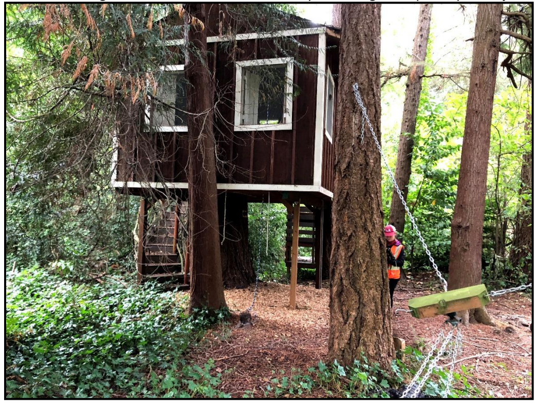
Photo 2. There is a treehouse and associated recreation apparatuses attached to trees near the center of the site.