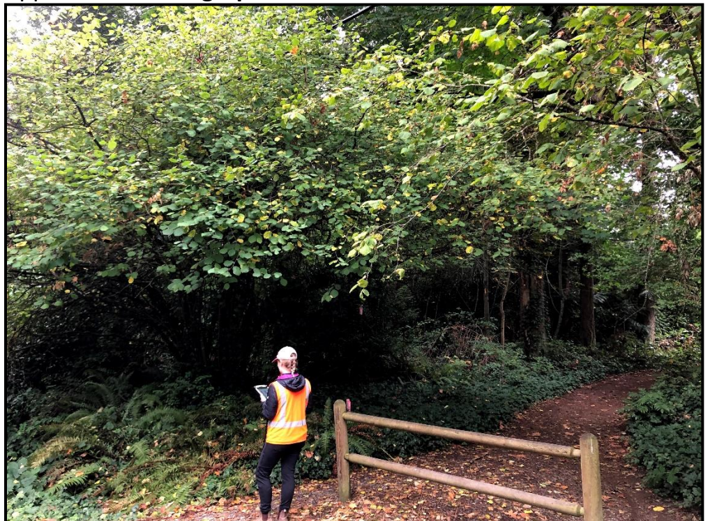
Photo 1. Looking southwest into the site. Walkway on the right is a public path adjacent to the site.