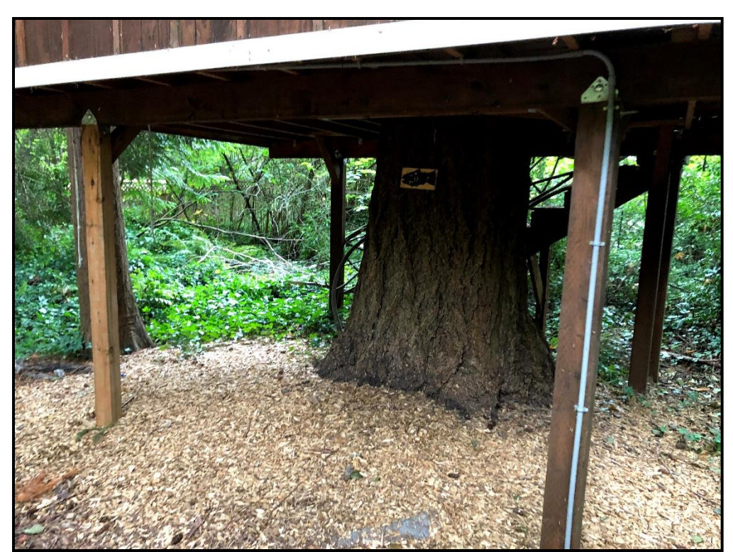
Photo 3. Tree 1806 is not serving as a primary support but is in the center of the treehouse with small attachment hardware. Large diameter surface roots are just below landscape fabric and mulch layer.